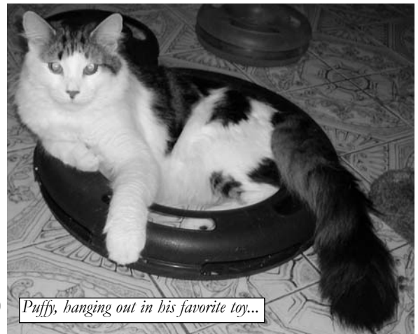
Puffy, hanging out in his favorite toy...

A faithful friend is the medicine of life - Old Proverb